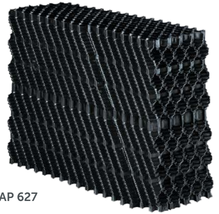
2H BIOdek® FAP 627

Maximum tolerances: On all dimensions +/- 20 mm or 2 %, whichever is the greater. Tighter tolerances and dimensions by prior agreement.